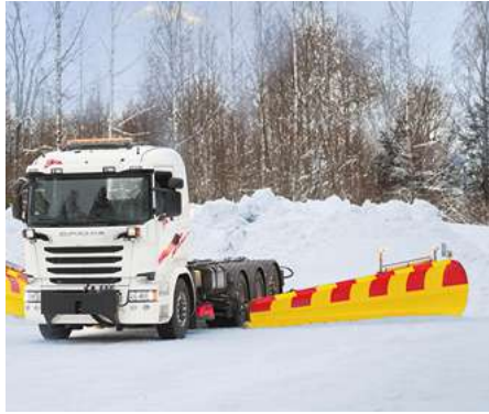
SHJ Snow plough