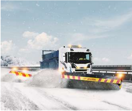
RMT Road maintenance truck