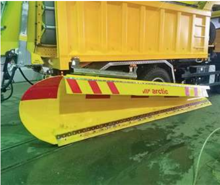
SHJ 216 J