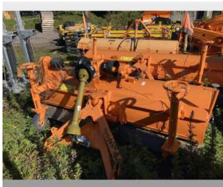
Basic Equipment Front-Mounted Sweeper VKS 4.2